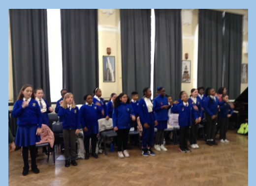
Our Year 5 and 6 Choir visited St Thomas More Secondary School and sang beautifully for them.