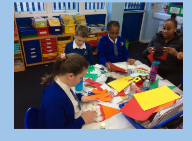
Parents joined their children this week in making decorations for their classrooms.