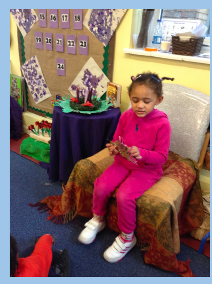
As part of No Pens Day on Friday, the children presented show and tell items to their classmates.